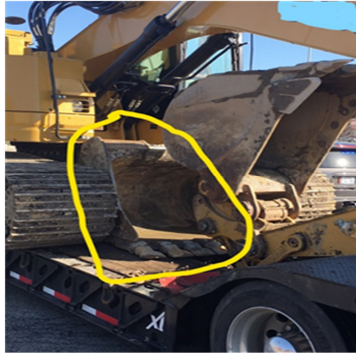
ATTACHMENTS NOT SECURELY MOUNTED ON OBJECT MOVED